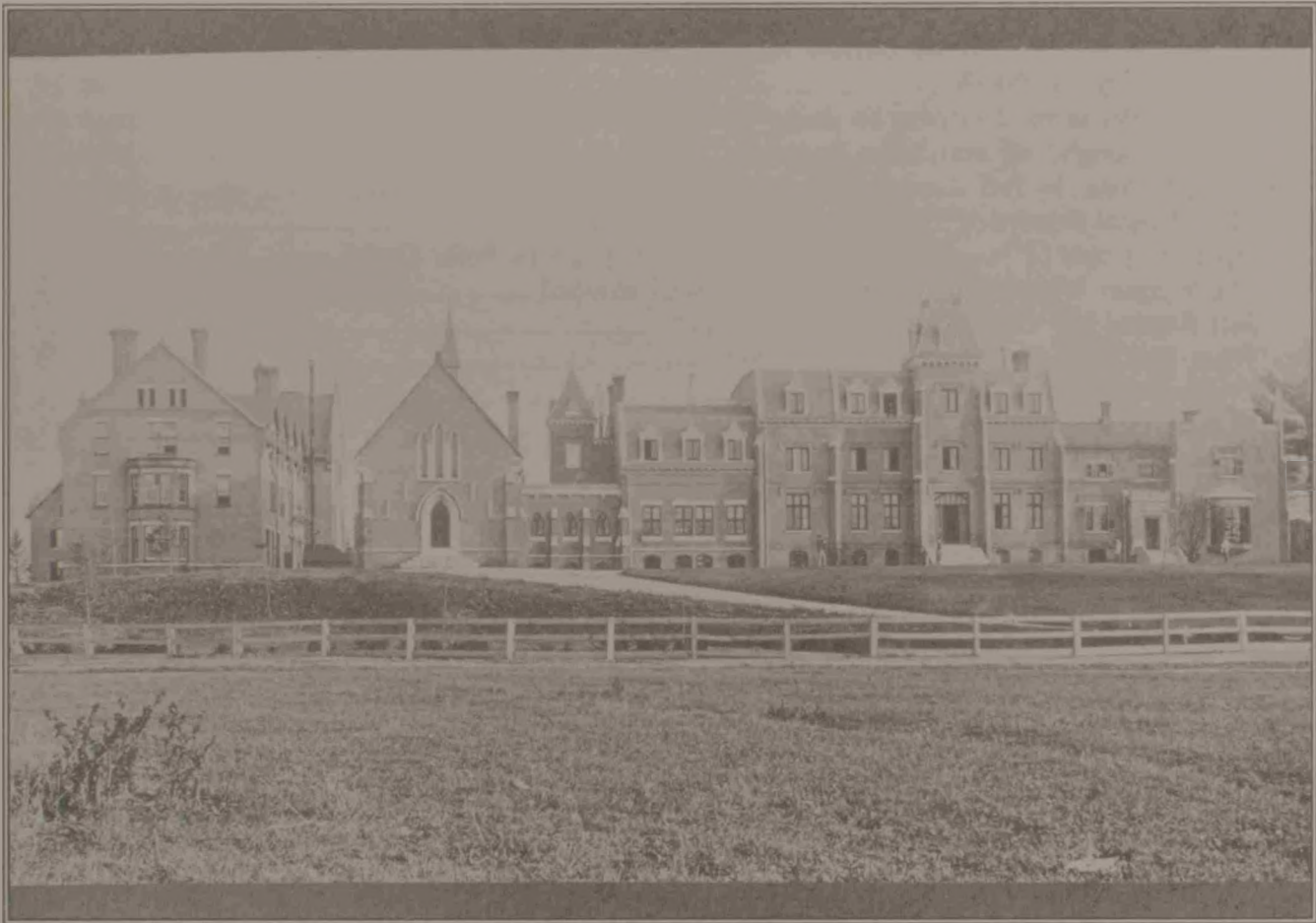
Bishop's University circa 1890, just prior to the great fire which destroyed the entire campus. The following year, all buildings were rebuilt exactly according to the original plans with the exception of the Johnson building (which replaced the building on the far left).