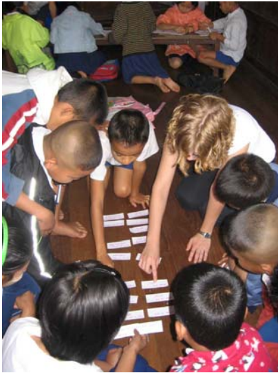
ET-MSEP Volunteer explaining a word game to Burmese children